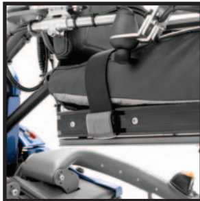
Uni-track system allows for extensive customization