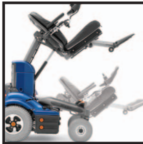
Optional 45° power tilt from any seat position