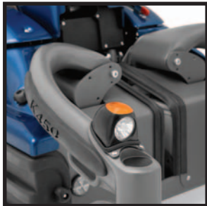
All-wheel suspension system for increased balance, improved ride and safety