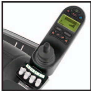
R-Net electronics for improved programmability