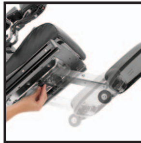
Tool-free adjustable legrest