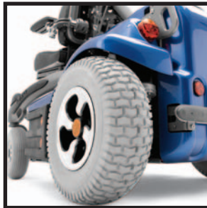
Large flat free tires for improved performance and reduced maintenance