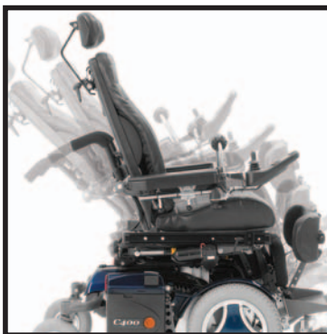
Power adjustable tilt