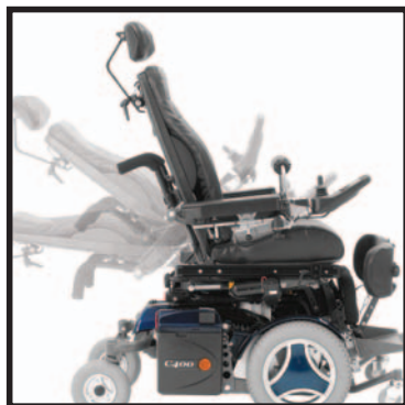
Power adjustable recline operates independently from power adjustable legrests