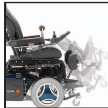
Power adjustable legrests operate independently from power adjustable recline