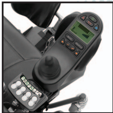
R-Net electronics with ICS