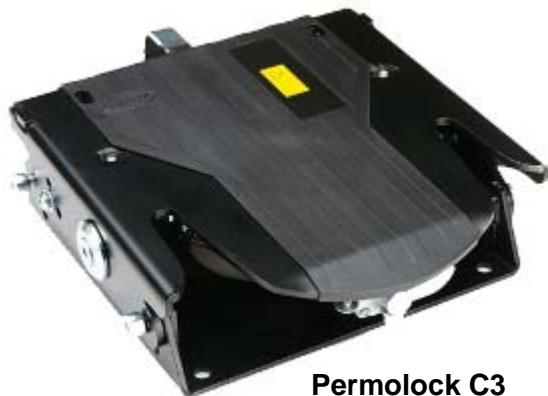
Permolock C3 (C300, C350, K300, K450, M300, M400)